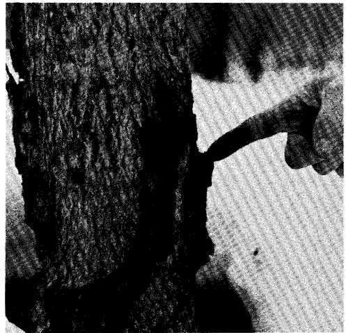
Figure 2. — Sugar maple is a hard species to kill. In this tree the cambium has survived and proliferated between injector cuts.