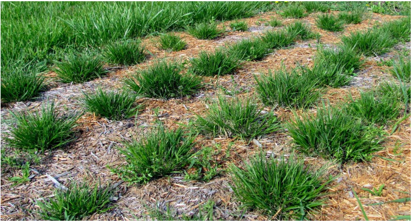
Seed production plots established with seedlings at Lincoln University, George Washington Carver Farm, Jefferson City, MO.

es. Preliminary results on genetic improvement of prairie junegrass ( Koeleria macrantha ) suggest that this species has the potential for adoption in golf course roughs and other low-input environment (12). However, more studies are needed to release cultivars that show good mowing quality and establishment rate among other characteristics such as drought and salinity tolerance.