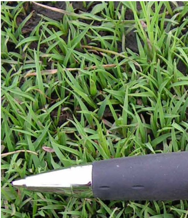
Fifteen day-old seedlings of poverty grass growing in the field in early spring.

air temperatures averaged 14° C. Seedlings remained green until the first killing frost in November. Percent ground cover in late April for plots seeded with 1000, 2000, and 3000 PLS/sq. ft. was 21, 21, and 30%, respectively, and in late May, it was 24, 25, and 27%, respectively.