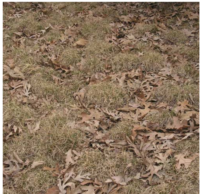
Poverty grass is usually found in full sun to moderate shade environments in upland forests, upland prairies, and glades. It tolerates dry and acidic soil and also grows in rocky soils.

According to Audubon International, tall grasses can provide several benefits including golf course beautification, greater plant and animal diversity, and reduced costs for maintenance by reducing the use of fuel, pesticides, and other chemicals (1). Several of the major challenges with using native grasses, especially native cool-season grasses, include limited amounts of high quality seed and limited knowledge as to identification and propagation techniques for these grass-