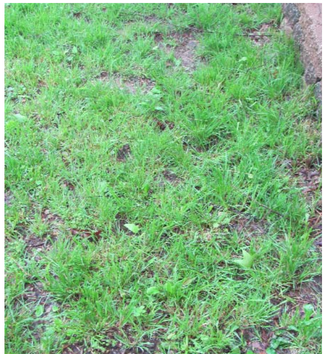
Demonstration plot established with poverty grass seed in a lawn.

For the second experiment, four sources of seed collected in Missouri were established under five light levels (20, 50, 70, 80, and 100% of sunlight) at Lincoln University's George Washington Carver Research Farm located in Jefferson City in spring 2009. At this site, plots were established on a well drained loamy alluvium. Planting site was sprayed with glyphosate in fall 2008 and twice in