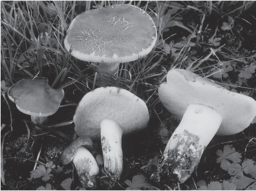
FIG. 1. Basidiomata of Boletus roodyi , Both 4597 (BUF).

contents in KOH; inamyloid, dextrinoid, or with pale grayish blue contents in Melzer's. BASIDIA 21.6–26.1 × 6.3–7.2 μm, clavate, (1-2) 4-sterigmate, hyaline or with yellowish contents in KOH, with golden yellow, yellowish brown or dextrinoid contents in Melzer's. BASIDIOLES 14.4–27.9 × 7.2–9 μm, clavate. PLEUROCYSTIDIA 35.1–53.1 × 7.2–10.8 μm, ventricose-rostrate or fusoid-ventricose, hyaline in KOH, few, smooth and thin-walled. CHEILOCYSTIDIA 18–36.9 (41.4) × 5.4–10 μm, versiform, fusoid-ventricose, fusoid, fusoid-mucronate or clavate, occasionally one-septate, hyaline or with yellow or yellowish brown contents in KOH, smooth and thin-walled. PILEIPELLIS a tangled layer of repent hyphae 2.7–5.9 μm broad, contents coral red in H 2 O, becoming yellow to grayish yellow in KOH; grayish yellow to yellowish brown in Melzer's; end cells cylindrical. PILEUS TRAMA hyphae moderately loosely interwoven, 4–9 μm broad, hyaline in KOH, yellowish brown to dextrinoid in Melzer's, smooth, thin-walled. HYMENOPHORAL TRAMA boletoid, divergent, grayish yellow in KOH; yellow, golden yellow or yellowish brown in Melzer's, in mass occasionally with a fleeting amyloid reaction; lateral strata elements 2.7–5.4 μm broad, loose; mediostratum 18–36 μm wide, parallel hyphae 4.5–15.3 μm broad. STIPITIPELLIS hyphae 3.6–16.2 μm broad, subparallel to interwoven, hyaline in KOH, orange yellow to dextrinoid in Melzer's.